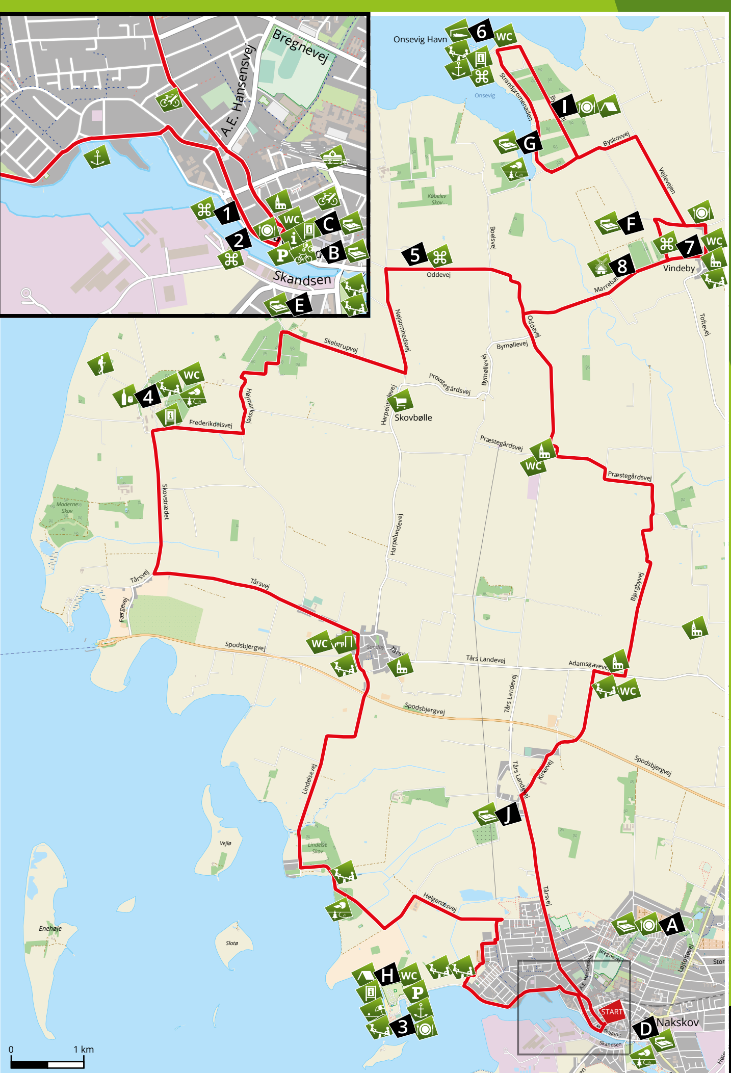
Grundkort © OpenStreetMap.org og bidragsydere · Design: Jerndorff.